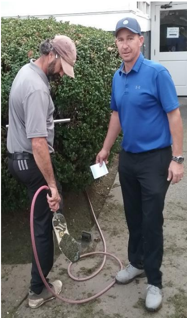
Balfour-Coscia first flite