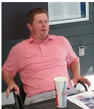
1 st Yup, done it again.