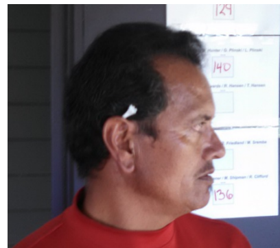
3 rd pretty good considering...