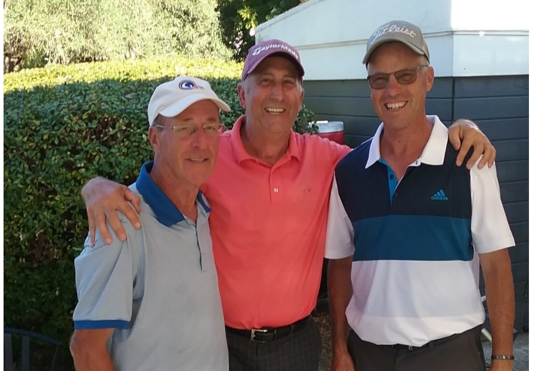
Three-fourths of the winning NCGA Qualifier team

This event is a year long engineering project for a team to make an impression. We don't bring in any 'shmoe' to get this chemistry disturbed. Players calculate handicap comps, long hitters no short game, short nockers great putters, alpha males and even beer intake consumption. The reward...a weekend golf bender to PoppyHills which includes green and cart fees paid by the club. When the team gets there they'll be tested because the best sandbaggers in the world hang out in these circles known as the NCGA Qualifier series .